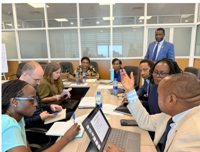
Hot discussion during the meeting to Strengthening Maternal and Child Health Services

The engagement focused on enhancing healthcare provider capacity through a coordinated multidisciplinary approach to improve maternal and child health services nationwide.