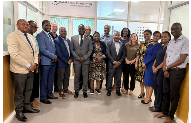
A group photo showing participants of the meeting to Strengthening Maternal and Child Health Services

Participants agreed that professional associations would jointly implement capacity-building activities, with AGOTA serving as the main recipient and partner associations acting as sub-recipients.