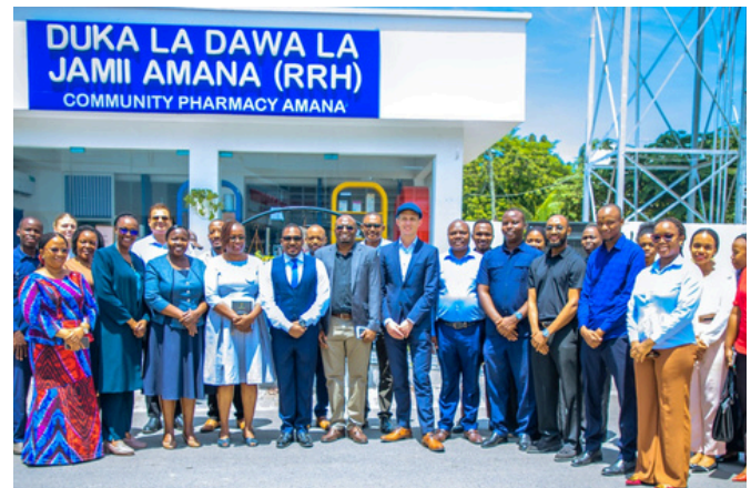
A group photo showing some participants of the BfB celebration at Amana RRH

The workshop provided an opportunity for clinicians, mentors, and partners to share experiences and review achievements made through integrated newborn care interventions. Participants highlighted improvements in managing respiratory distress, early detection of complications, and increased confidence among healthcare providers, all contributing to better neonatal survival outcomes.